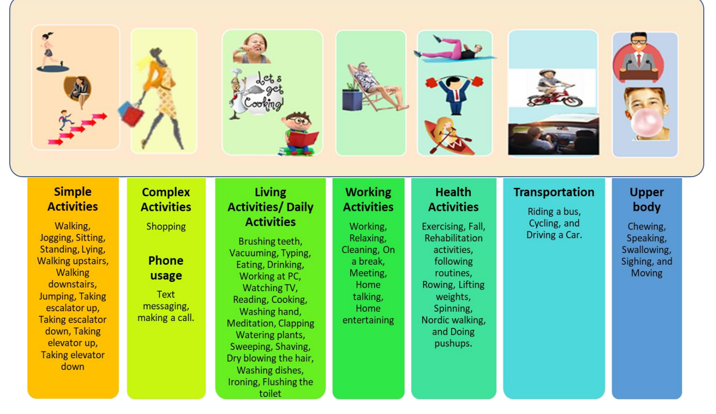
Figure 3: Various types of activities according to category