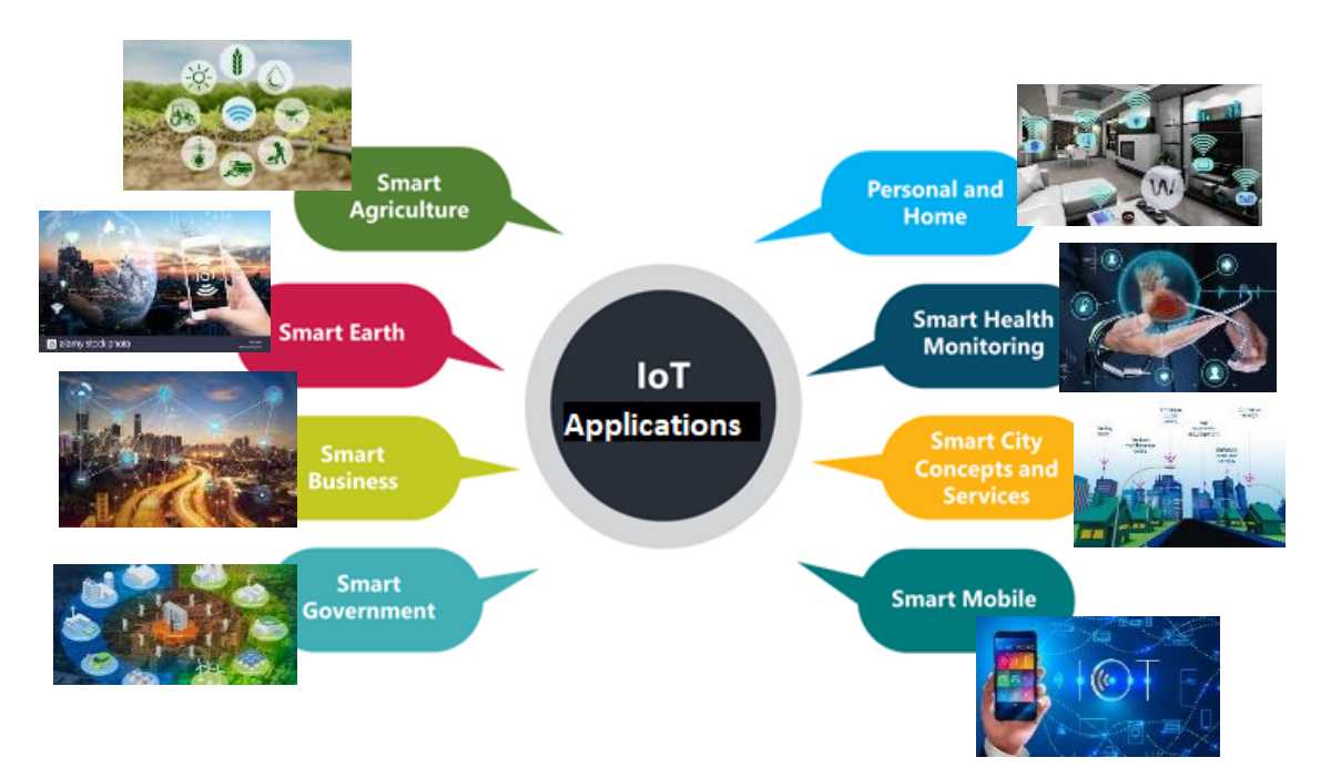
Figure 1: Major IoT Applications

It is one of the prominent domains of Smart City application. All aspects of VANET safety involve communication, decision making, observation, and action. Currently, self-driving cars are also high attention to intelligent transportation. And this is possible due to sensors embedded in them [11].