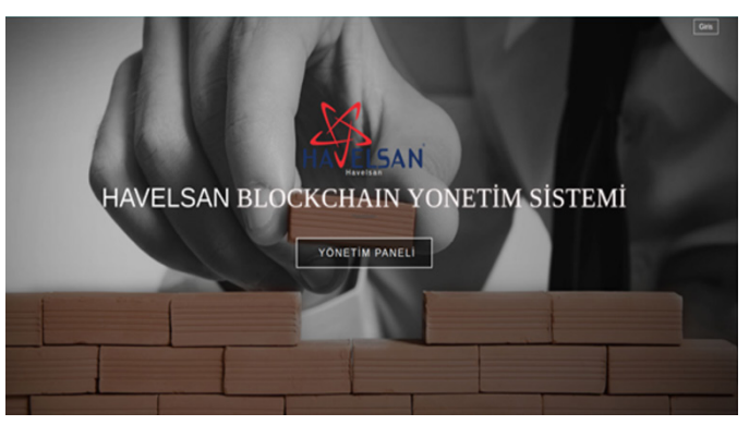
Figure 3: Login Page of Developed Blockchain Smart Contract Application Framework

When our needs are evaluated; since we aim to develop applications with specific needs for specific customers, private Blockchain and offering more flexible options seem more appropriate to meet our needs. Therefore, it appears that Hyperledger fully meets these criteria. As a result, the Hyperledger was chosen as the infrastructure to be used when developing our Blockchain application framework, and the study was carried out using this infrastructure. The screenshot of the login page of the developed Blockchain Smart Contract Application Framework is given in Figure 3.