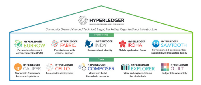
Figure 2: Hyperledger Product Tree [9]

thus, a new setup will emerge that will include different actors on a global basis. Unlike its competitors, which currently offer Blockchain-based smart contract infrastructure, the Hyperledger Project has targeted areas of application outside of cryptocurrencies since its first appearance. It is seen that Hyperledger produces a wide range of solutions for different needs for incubation at all development stages for enterprise-class Blockchain [7] (Figure 2). Fabric is one of the most popular products offered by Hyperledger. It has been the reason for the preference of users especially with its modular structure and flexible architecture. Fabric offers its users a smart contract infrastructure suitable for various usage scenarios. It also offers the flexibility to apply the consensus model suitable for the applications to be developed. Hyperledger Fabric is the first Blockchain network created in a specific standard using programming languages, without any cryptocurrency dependency. Besides, having a structure that supports digital identity enables the development of applications in a wide range of products. Currently, the Proof of Work (PoW) consensus algorithm used in many Blockchain applications, such as Bitcoin and other cryptocurrencies, does not have to be used, so it offers important solutions to overcome problems such as resource consumption and performance [8].