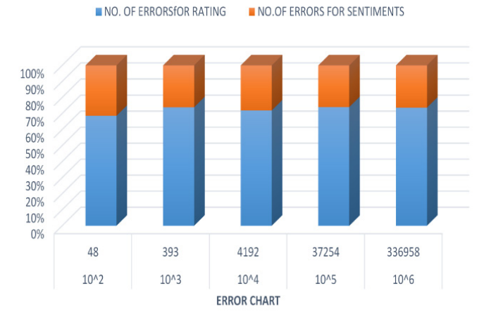
Figure 1 Error detection for senti-PTF and rat-PTF

For comparison, we implement and report the performance of senti-PTF and rat-PTF prediction. For the consistency of expression we still use "customer" and "item" to represent reviewers of automotive products. We estimate error rates on sentiments and ratings expressed, to assess the performance of our model and had the following results (figure1): The error graph shows how our algorithm; senti-PTF and rat-PTF performed. Senti-PTF performed better than rat-PTF in terms of prediction performance