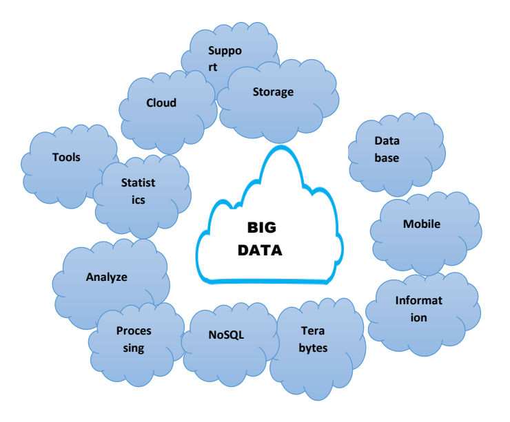
Figure 1: Big Data Sources

clinical data from Clinical Decision Support systems (CDSS) (physician's notes, genomic data, behavioural data, data in Electronic Health Records (EHR), Electronic Medical Records (EMR)), machine generated sensor data, data from wearable devices, Medical Image data (from CT scan, MRI, X Ray's etc.), medical claim related data, hospital's administrative data, national health register data, medicine and surgical instruments expiry date identification based on RFID data[3-6], social media data like Twitter data, Facebook data, web pages, blogs and various articles.[7]