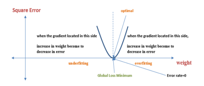
Figure 3: Optimum case in Gradient Descent

The processes of forward and backward propagation continue from under-fitting to optimal means the accuracy arrives to the highest plateau, which is lowest error rate. As shown in Figure 3.