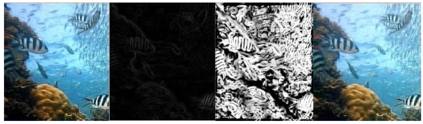
Figure 4: Proposed Method