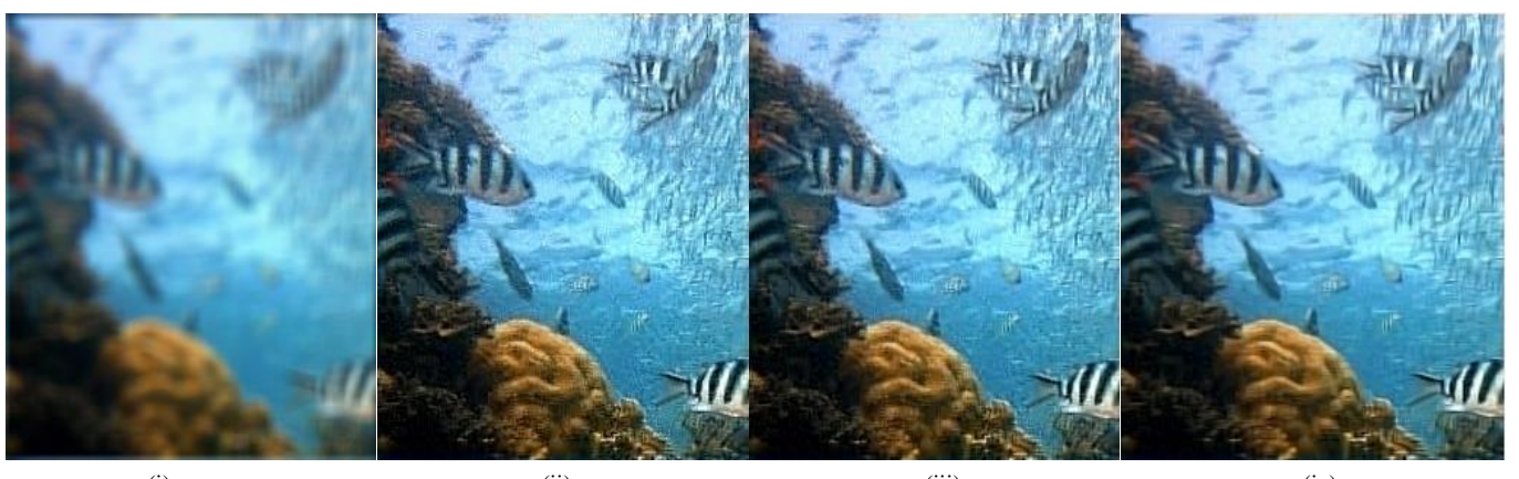
(i) (ii) (iii) (iv) Figure 3: Underwater Turbidity Removal. (i)Blurred picture (ii) ASDS (iii) ASDS using AR (iv) ASDS using AR and NL

A.Chrispin Jiji et al. / Advances in Science, Technology and Engineering Systems Journal Vol. 3, No. 6, 97-104 (2018