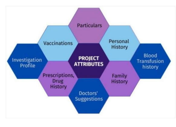
Figure 1: Features Diagram