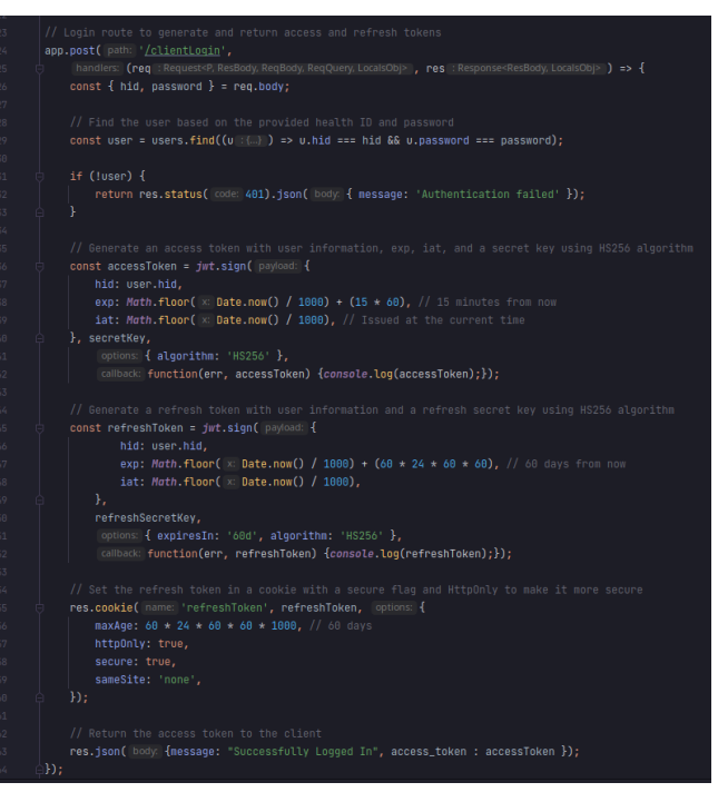
Figure 3: Code Snippet Illustrating User Authentication

The information will be stored in two separate databases. MongoDB will handle the orthodox data, while Smart Contract will store significant EMRs to enhance long-term protection. Additionally, MetaMask has been incorporated into the system as a wallet for overseeing and managing expenses related to ether.