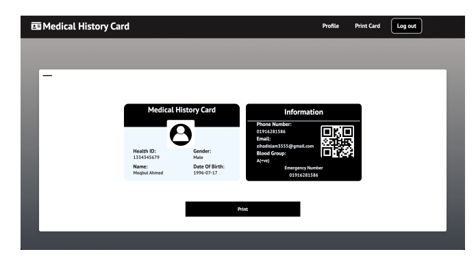
Figure 8: A Demo of the Medical History Card

The registration and login pages contain four individual cards designed for each of our four users (Fig. 7). In the registration process, both the birth identity (BID) and national identification (NID) are collected as input, as the web application allows patients under the age of 18 to create accounts. In such cases, the BID becomes a mandatory requirement. After that, a success message will be received as well as the client could see the automatically generated HID in the message. Likewise, users can log in with the help of the login page after registration.