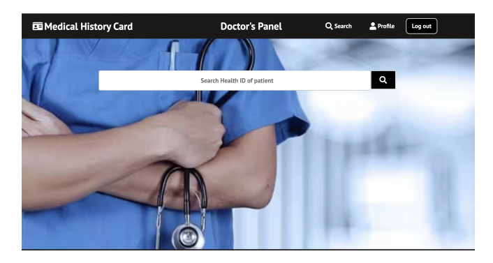
Figure 9: Doctor's Searching Panel

The inclusion of a unique HID and QR code for each patient card adds an extra layer of convenience and security to the web application for both doctors and patients. It also adds an extra layer of security by ensuring that only authorized personnel (doctors and the respective patients) can access and view the associated medical records. Additionally, patients have the option to download and print their cards by clicking the "Print" button within the website's application, as illustrated in Figure 8.