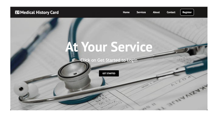
Figure 6: Home Page of the Website

In this section, the output of the web application has been demonstrated in order to get a clearer web experience. More especially, with the use of screenshots from the web application, the actions of the four different user types— doctors, patients, the vaccine team, and the reporting team—are elucidated.