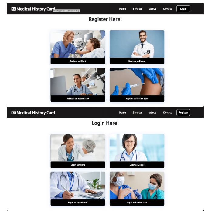
Figure 7: Registration and Login Dashboard

The MHC starts with a Home page. This on boarding page will help the users learn how to get started and derive value from it (Figure 6). The home page contains a Navigation bar at the top to direct to a particular sector as per the user's requirements.