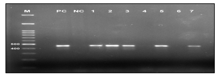
Figure 2: Representative gel image showing amplified HPV 16 gene product of 468bp (M= Marker, PC= Positive control, NC= Negative control)

Twenty-five cases of cell block with HPV correlation showed 6 cases with HPV positivity. All 25 cases were subjected to p16 <sup>ink</sup> <sup>4a</sup> IHC, of which 18 cases of chronic cervicitis were negative, two cases of koilocytic atypia were negative, one case of LSIL was weak positive, two cases of HSIL were strong positive and two cases of SCC were also strongly positive.